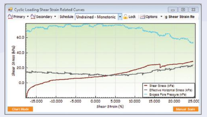
Cyclic Loading Monotonic Shearing Graph