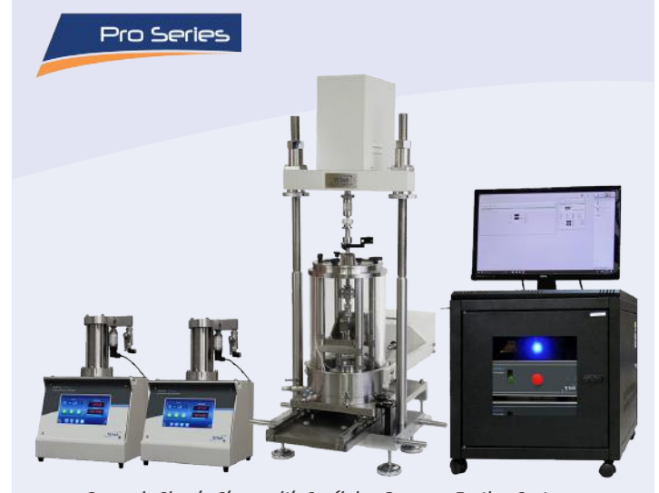
Dynamic Simple Shear with Confining Pressure Testing System