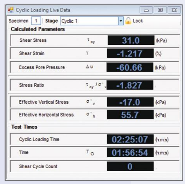
Cyclic Loading Live Data