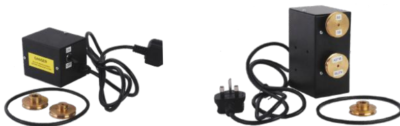
VJT5305 - Lab Vane Motorising Attachment (BS)