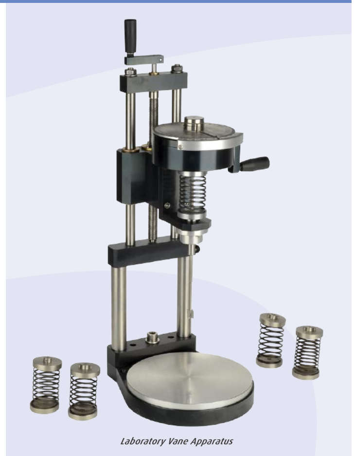
Laboratory Vane Apparatus