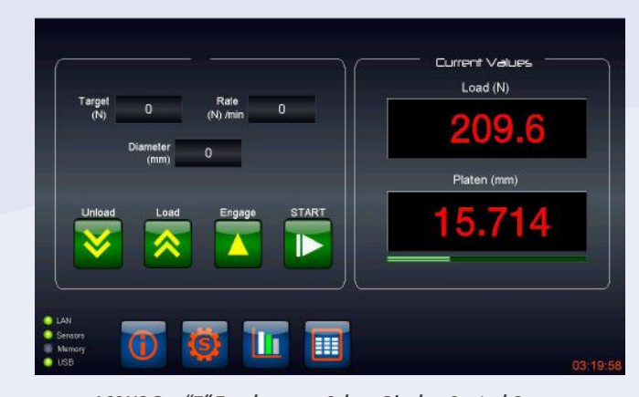
ACONS Pro "7" Touchscreen Colour Display Control Screen